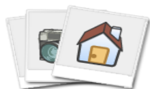
Photo not available

Property Type: Vacant Land Area: 601 m 2 Area $/m 2 : $699 RPD: L3 SP321180