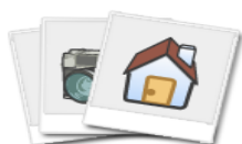
Photo not available

Property Type: Vacant Land Area: 405 m 2 Area $/m2: $1,025 RPD: L16 SP323005